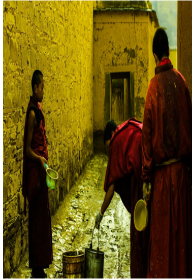
Tibetan/Hui People along the journey

Day 10 Back Chengdu : We bus to Chengdu after breakfast. It is a long drive taking approximately 6-7 hours. O/N Chengdu.