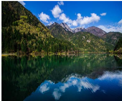
Jiuzhaigou stunning View